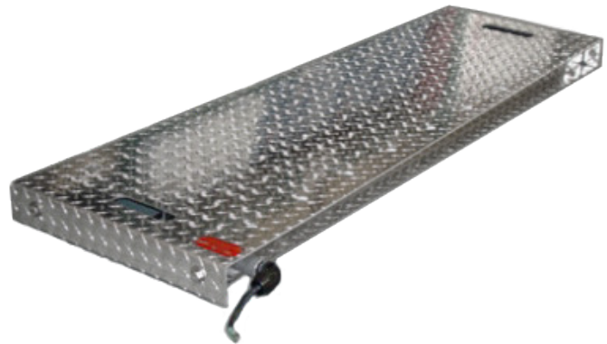
Table 10 – Platform Heater Selection Guide