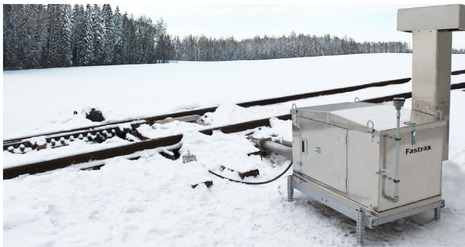
Figure 18 – FEB-204803